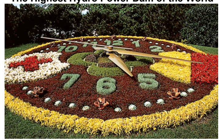
The biggest Flower Clock in the World