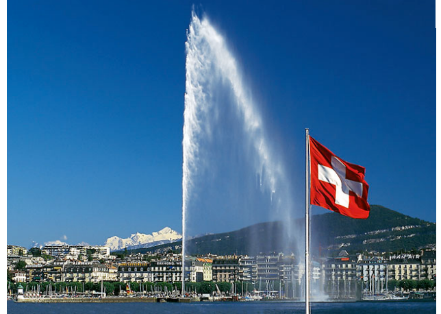
The highest Fountain of the World