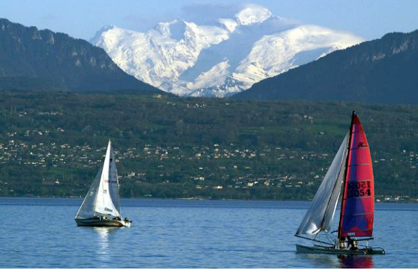
Mont Blanc - Highest Mountain in Europe