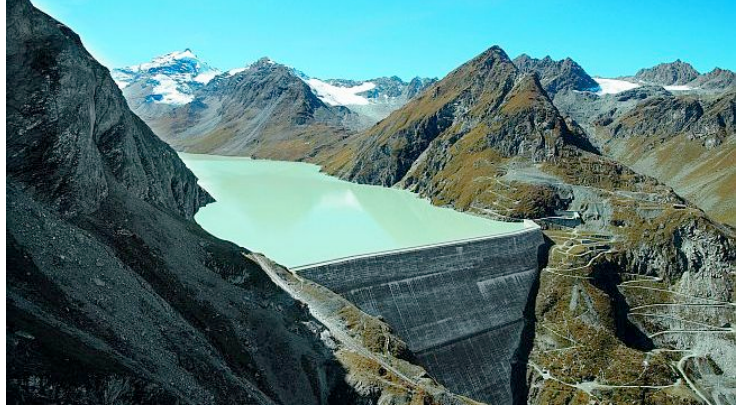
The Highest Hydro Power Dam of the World