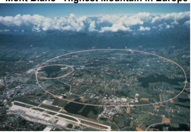
CERN the biggest Synchro Cyclotron