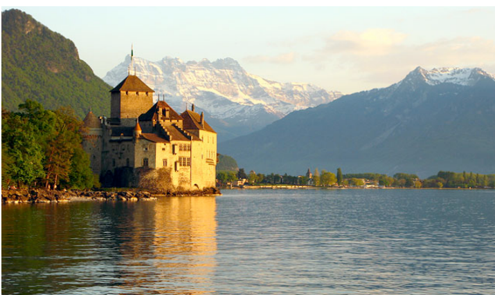
Chillon Castle on Lake Geneva