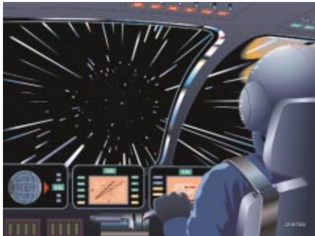
NASA BR/LES BOSSINIS

Spacecraft capable of interstellar travel will approach the speed of light, and may have to extract energy from the vacuum of space. However, researchers could be years or decades from achieving the breakthroughs necessary to build such a propulsion system.